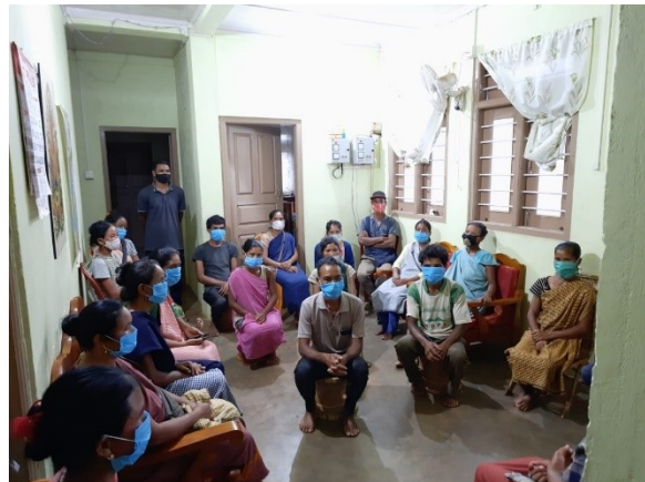
Meeting with Parents of students over remedial classes

The Brothers in Umtyrkhang are collaborating with Mait Shaphrang, a local Self-Help Group, in setting up a Piggery Project in the village. The Self-Help Group members and their families did all the labour work of carrying the stones and sand and constructing the piggery shed. They will also take care of daily cleaning and upkeep. The Brothers have offered the land near their house and will support them financially.