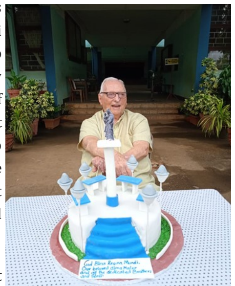
The first Principal of Regina Mundi

Meanwhile, a 42’ pillar was erected on Chicalim Hill and a six-foot statue of Madonna and Child was placed upon it. The Enclosed Carmel Sisters, to whom the statue was first given, occupied the